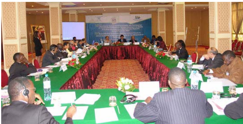
Participants of the PCC meeting

The PCCs appreciated the innovative initiatives undertaken by PPD to accelerate the achievements of the ICPD Goals and MDGs. They agreed that the implementation of these plans should be supported by the member countries at national level, where PCCs can play a greater role by involving other ministries and mobilizing resources. The role of civil society organizations through networking was also noted to be crucial for the implementation of the plans. In addition, PCCs urged for a strengthening of the Regional Networks in Africa. The contributions of China in Capacity Building, RH Commodity Supply and Transfer of Technologies were well received and appreciated by the participants.