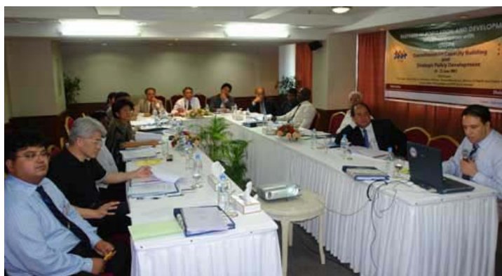
Participants in one of the sessions of the workshop

The experts reviewed and discussed the contents of the modules at the meeting. The following issues were discussed during the meeting: