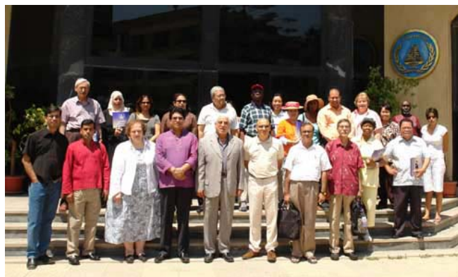
Participants in front of the Cairo Demographic Centre (CDC)