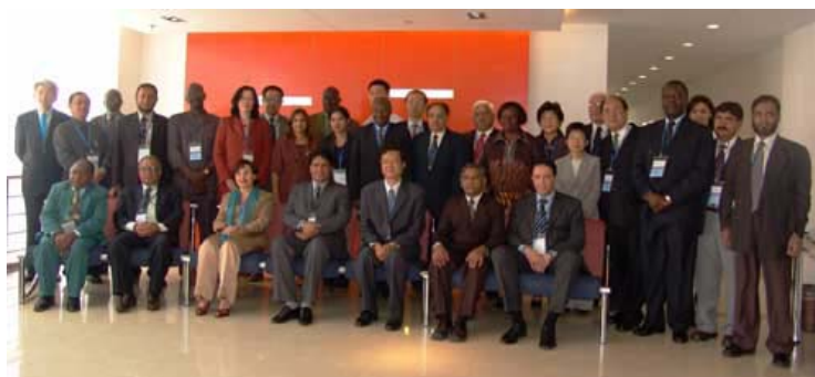
Participants of the Workshop on Capacity Development in Taicang, China

The main objectives of the Consultative Meeting were: