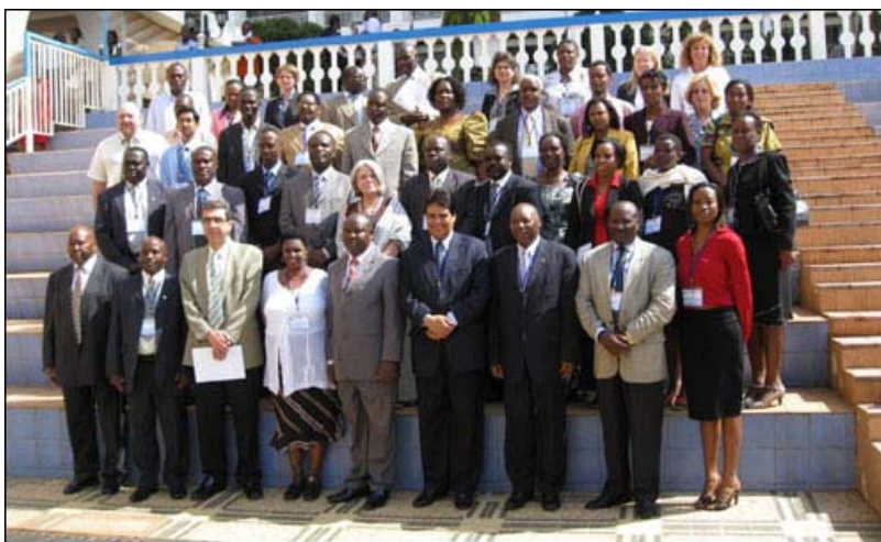
Participants of the EARHN Meeting, together with H.E. Major (Rtd) James Kinobe, Honourable Minister of State for Youth and Children Affairs, Government of Uganda

PPD Africa Regional Office organized the Eastern Africa Reproductive Health Network (EARHN) Meeting in Kampala, Uganda in 2 – 6 December 2007. The main objectives of the meeting were to revise the EARHN Strategic Plan 2001 - 2005, gain stakeholder support and develop a coalition to work towards increased collaboration among Eastern African countries in the areas of Reproductive Health, Population and Development. The meeting laid a strong foundation for long- lasting and mutually beneficial partnerships and developing a regional network to address RH, Population and Development issues.