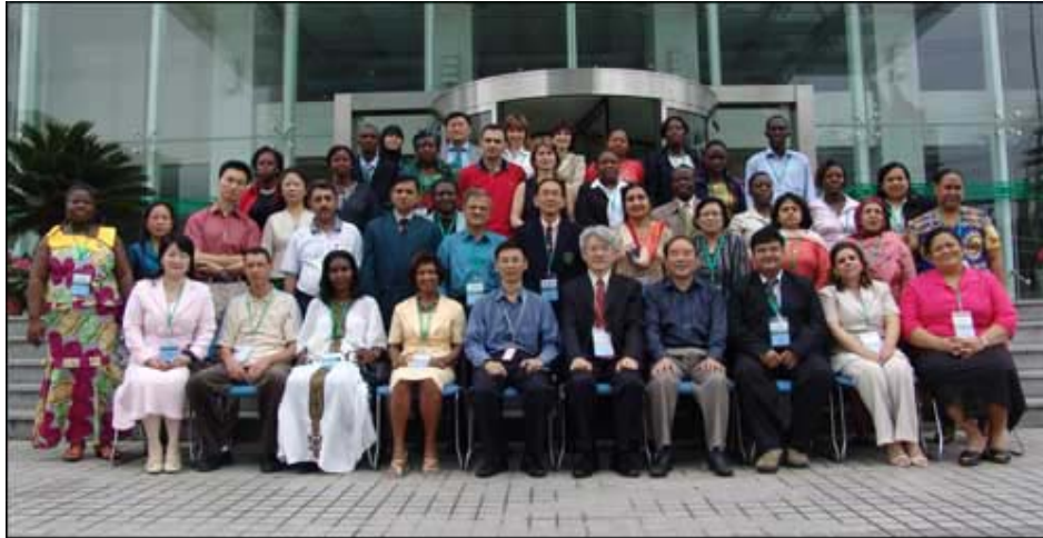
Participants of the MCH Workshop in Shanghai, China