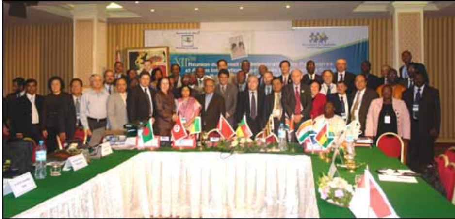
Participants of the Twelfth Annual Board Meeting

The Board approved, among others, the Strategic Business Plan, Capacity Development Plan, Strategic Plan for Africa and the Rabat Declaration containing recommendations formulated at the International Forum on ICPD and MDGs held immediately before the Board Meeting. The Board decided to hold the next Annual Board Meeting in Sana'a, Yemen in November 2008.