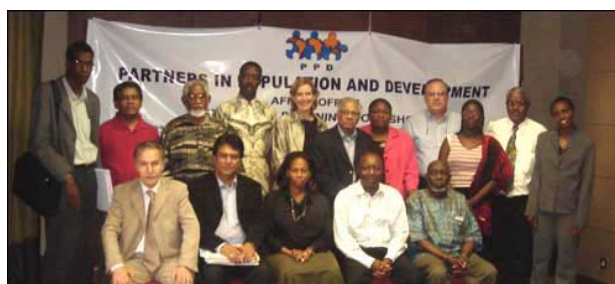
Participants of the PPD Africa Strategy Development Workshop in Kampala, Uganda

The opening of the Africa Regional Office was followed by a four-day workshop for the development of PPD Africa Strategy in Kampala, Uganda from 23 to 26 February 2007. The workshop brought together eminent strategy development experts in the field of Reproductive Health, Population and Development, and representatives of major stakeholders in Africa such as PPD African Member States, IPPF Africa Regional Office, African Union, and UNFPA Technical Support Division,