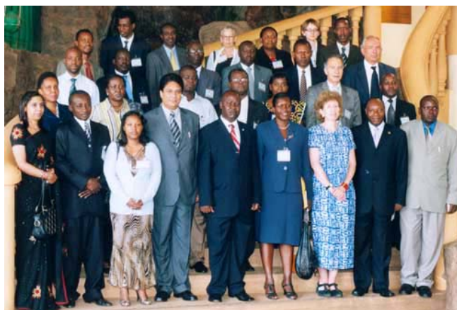
Participants of the African PCC Meeting