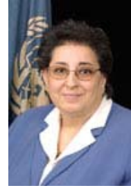
Dr Thoraya Obaid, ED of UNFPA

In her statement at the opening session, Dr Thoraya Obaid, Executive Director, UNFPA pointed out that the amount of support given to the family planning sector had declined to 9 percent from 55 percent in 1994 and indicated that unless greater support was given to Reproductive Health services, including family planning, the objective of providing universal Reproductive Health services by 2015 would not be met.