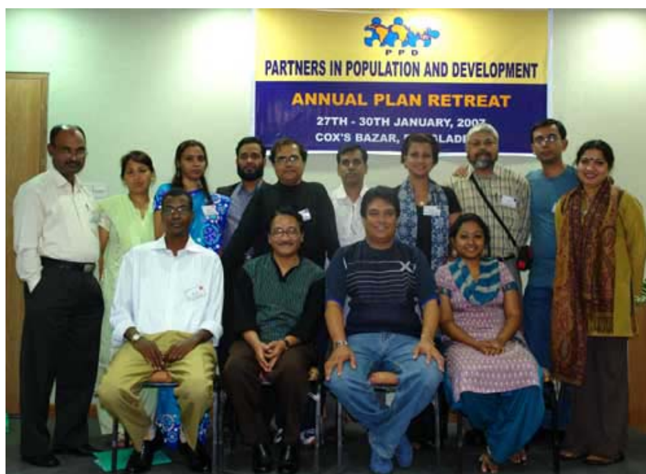
PPD Staff at the Annual Plan Retreat 2007

The 2007 Annual Planning Retreat was particularly important and different from other retreats since there was a new leader with a new perspective and new visions who had completed his first year in office by successfully attaining a complete grasp of the overall condition of the organization. At the very outset, the Executive Director provided a brief but