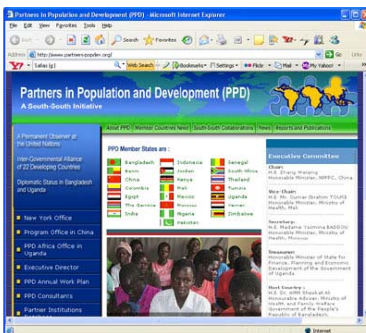
Home page of the PPD Website