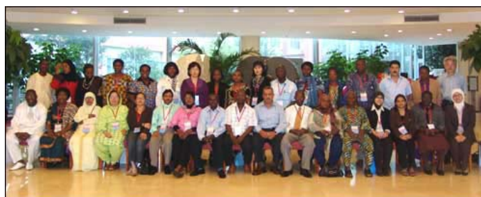
Participants of the workshop in Taicang, China