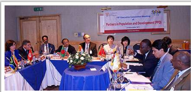
Executive Committee Meeting

The Board Members agreed that the 17th Annual Board meeting will be held in November 2012 in Bangladesh. These meetings reviewed a new