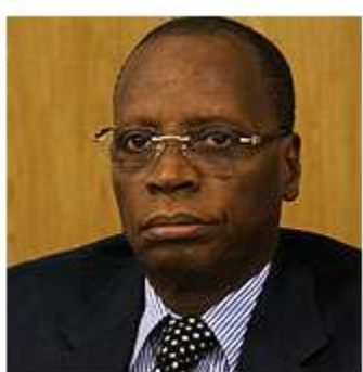
H.E. Dr. Shamsudeen Usman, Honourable Minister and Deputy Chairman, National Planning Commission (NPC) of the Government of the Federal Republic of Nigeria chairs one of the session