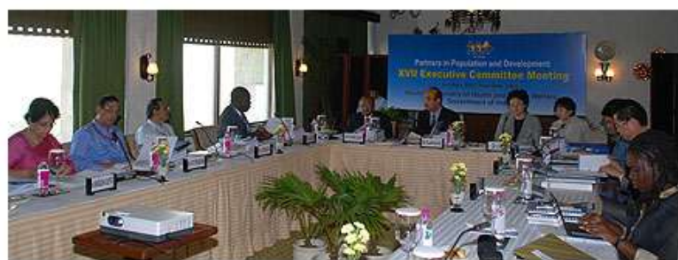
17 th Executive Committee Meeting in India

The 17th Executive Committee Meeting of PPD was held in Delhi, India from 2-4 April, 2011. The meeting was jointly organized by PPD and the Ministry of Health and Family Welfare, Government of India.