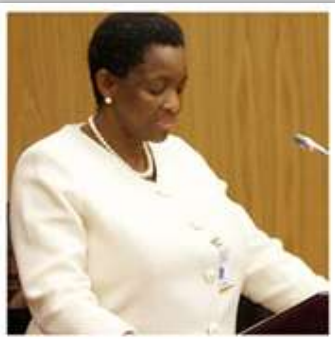
H.E. Ms. Bathabile Olive Dlamini, Honourable Minister for Social Development of the Government of the Republic of South Africa delivering her opening speech

The government of South Africa and Partners in Population and Development organized the International Conference on "Population Dynamics, Climate Change and sustainable Development" in Pretoria from 1-2 November 2011. H.E. Ms. Bathabile Olive Dlamini, PPD Board member and Honourable Minister for Social