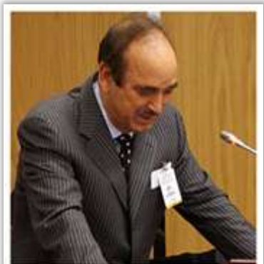
H.E. Mr. Ghulam Nabi Azad, Honourable Union Minister of Health and Family Welfare of the Government of India delivering statement in the opening session

Union Ministry of Health and Family Welfare of the Government of India emphasized that the route to a climate sustainable human population, to a