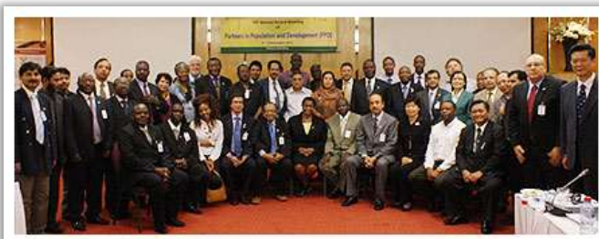
Participants of the Board Meeting

PPD organized its 16th Annual Board meeting and 18th Executive committee meeting in Pretoria South Africa with remarkable participation of its Board members. H.E. Mr. Ghulam Nabi Azad, Honourable Union Minister of Health and Family Welfare of the Government of India and Chair of the PPD Board presided over these events. The Board Members renewed commitment and support of their respective Governments towards South-South Cooperation in the greater interest of the developing countries.