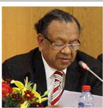
H.E. Prof. A. F. M. Ruhul Haque, MP, Honorable Minister of Health and Family Welfare (MOHFW), Government of the People's Republic of Bangladesh delivering speech in one of the session