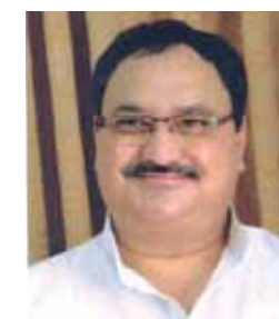
H.E. Shri Jagat Prakash Nadda