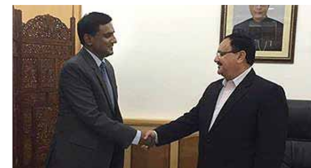
ED, PPD welcomes the new Chair of PPD on 18th November 2014 in New Delhi