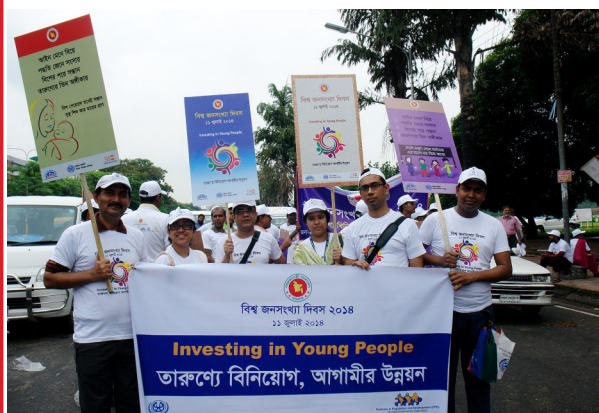
PPD celebrated the World Population Day 2014 with Bangladesh Government and other stakeholders

For the detail statement please visit: http://www.partners-popdev.org/docs/Chair_Msq_WPD2014.pdf