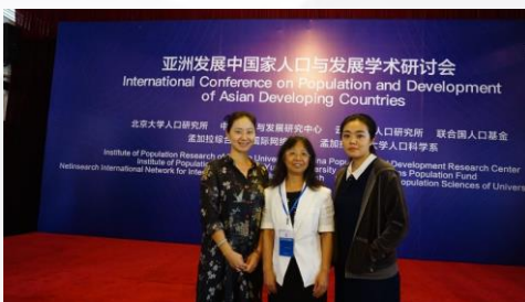
1 st ACPD in Kunming, Yunnan Province. Aug 7-9, 2018