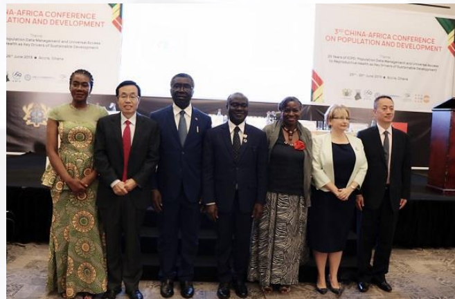
The 3rd China-Africa Conference on Population and Development Accra, Ghana, June 23-26, 2019