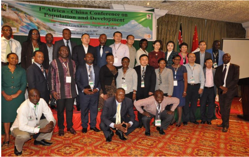
1st Africa-China Conference on Population and Development, Nairobi, Kenya, 2017