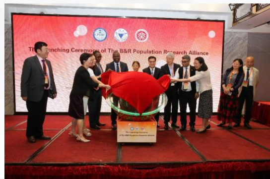
Launching Ceremony of the Belt and Road Population Research Alliance during the 2 nd ACPD in Hangzhou, Zhejiang Province. Jun 7-9, 2019