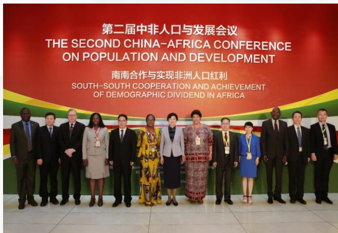
The 2nd China-Africa Conference on Population and Development July 9-10, 2018, Guangzhou, China.