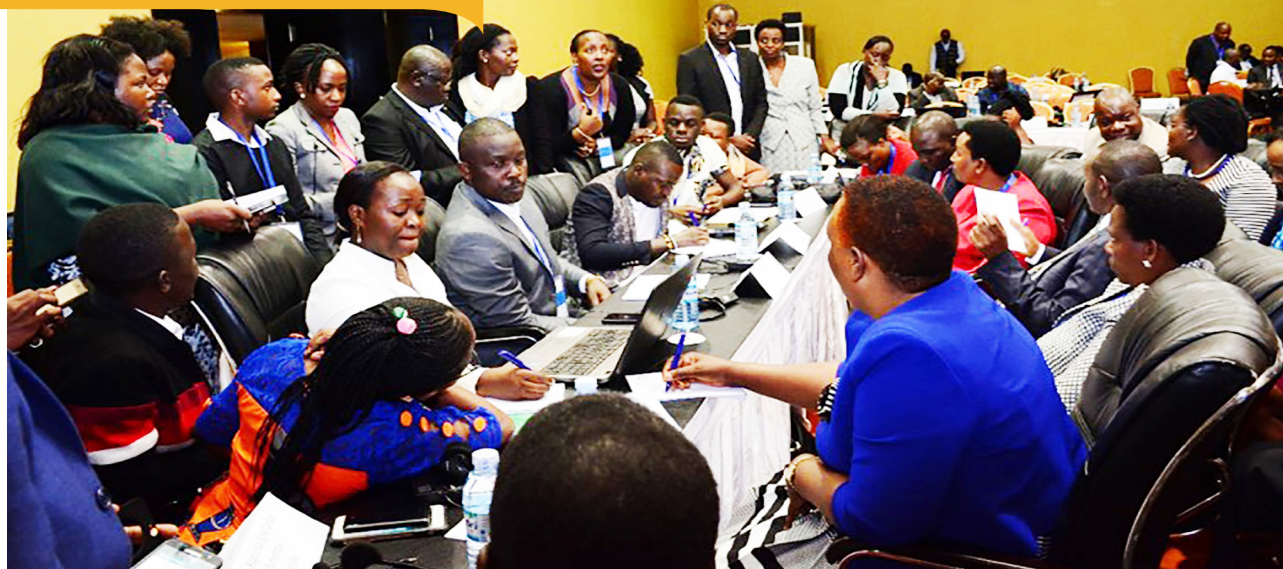
Uganda National Health Insurance Stakeholders discussing with Parliamentarians in October 2019 in Munyonyo during an Africa Parliamentary meeting on Health .

The two can co-exist. National insurance covers what is not covered under private insurance. Where costs are not covered under NHI then this is covered under private insurance. Some services are not paid fully, therefore NHI pays part. Health education should be part of the coverage under the scheme.