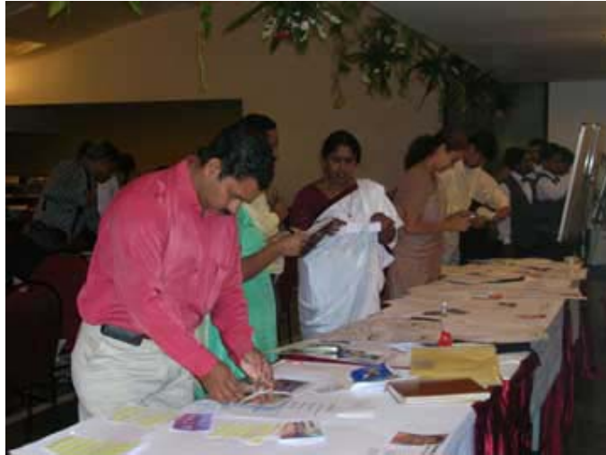
National Dissemination Workshop in India