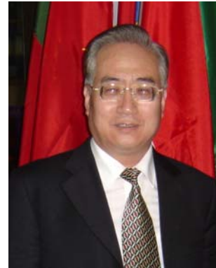
H.E. Zhang Weiqing Chair, PPD Board

I would like to take this opportunity to thank all my colleague Ministers of PPD Board for their trust in me and for having re-elected me to serve a second term as chair of this prestigious organization. I commit to keep up to their expectations and look forward to a very fruitful collaboration and support.