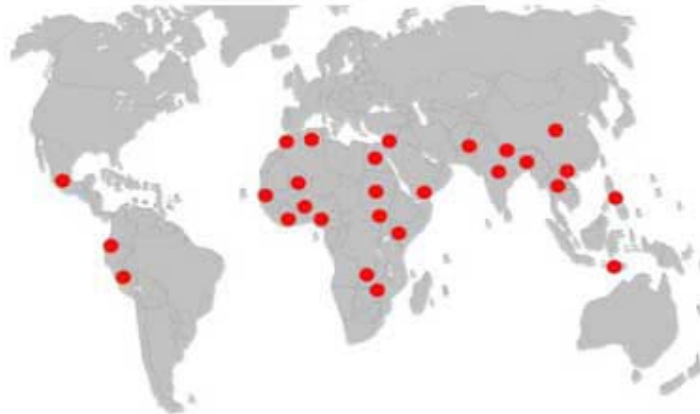
PPD Consultant Network. 27 Countries in 4 Regions

During 2005, twenty six new consultants from eleven developing countries joined this database making the total number to be 100 consultants from twenty-seven developing countries. The consultants are experienced in research, training, advocacy, monitoring, evaluation and overall management of reproductive health, population, gender and poverty alleviation programs.