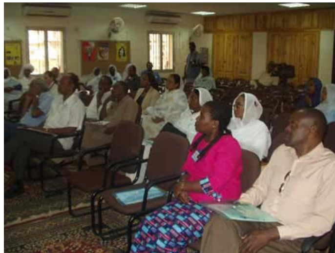
National Dissemination Workshop in Sudan

The VLP Task Force convened its Eighth Meeting in Kuala Lumpur, Malaysia in July 2005 where the plans for the final project activities were discussed and agreed upon. In September 2005, four National Dissemination Workshops (NDW) were organized in Nigeria, Ethiopia, Sudan and India. At the end of two and a half years of successful project implementation, the NDWs identified and promoted a group of committed and trained visionary leaders in population and reproductive health. The principal objective of the NDWs was to share experiences and, “showcase” the actions and achievements of the VLP participants (known as “VLP Fellows”) in their professional capacity and as VLP graduates. The workshops were actively participated by the fellows, representatives from anchor institutions, mentors, donor agencies and other stakeholders.