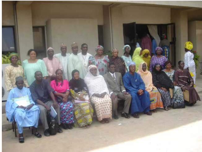
National Dissemination Workshop in Nigeria

The PPD Secretariat is implementing this leadership development project in consortium with International Council on Management of Population Programmes (ICOMP) and Centre for African Family Studies (CAFS), which is funded by The David and Lucile Packard Foundation. The overall objective of the project is to contribute to the improvement of the reproductive health and rights of men, women and adolescents of the selected countries namely Ethiopia, India, Nigeria and Sudan, since late 2002 through the creation of a critical mass of visionary leaders and strengthening their knowledge and skills.