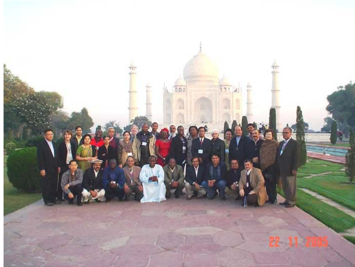
Participants of the Forum in front of the Taj Mahal, Agra, India.