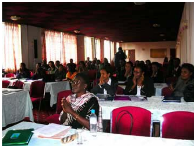
National Dissemination Workshop in Ethiopia