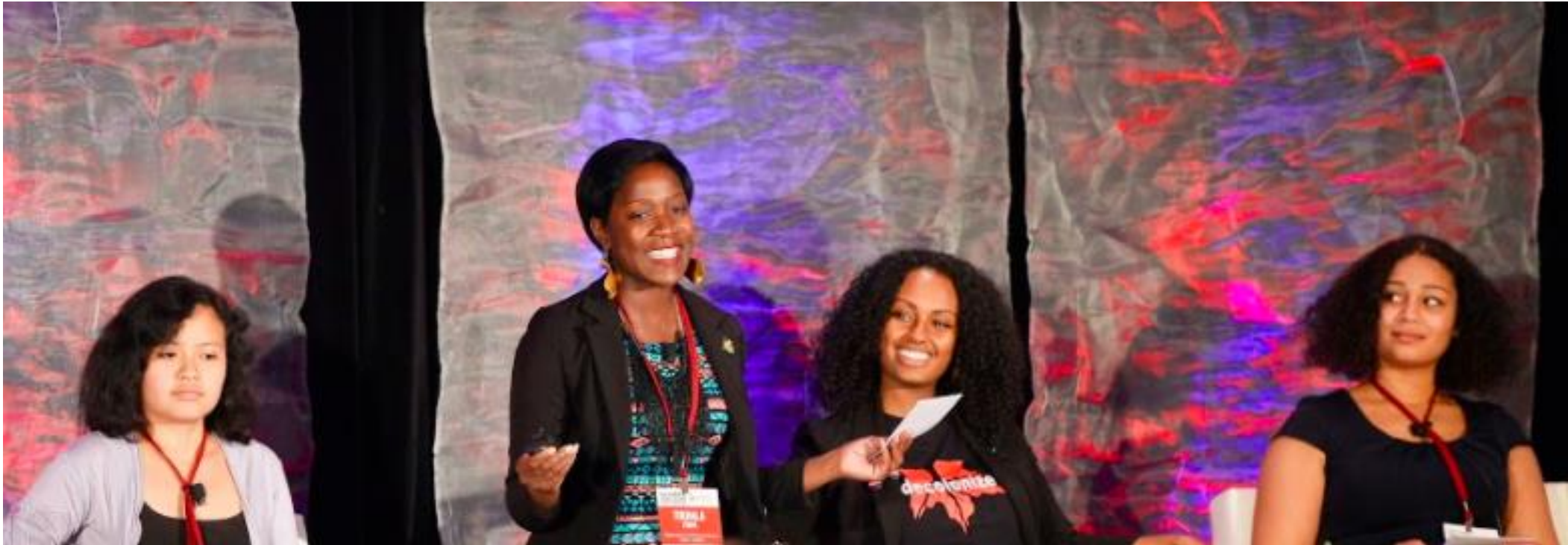
Panel of Young Leaders, CanWaCH 2017