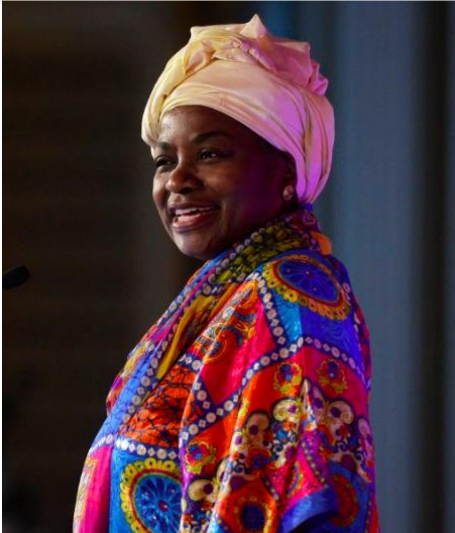
Natalia Kanem, CanWaCH 2017