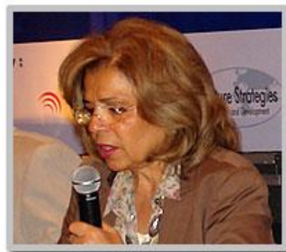
H.E Dr. Moushira Khattab, Honorable Minister of State for Family and Population, Government of the Arab Republic of Egypt

The Session was Chaired H.E. Dr. Moushira Khattab, Member of the PPD Board and Honorable Minister of State for Family and Population, Government of the Arab Republic of Egypt . In her introductory remarks, she noted that population growth has become a major concern especially in third world countries which are burdened with huge population and high annual population growth rate. She further noted that the territorial area and resources of these countries remains almost constant whereas the population rises at a steep gradient reflecting less area allocation per human. Moreover, she observed, these countries face numerous problems like illiteracy, low economic growth rate and scarcity of resources which has led to growth of acute poverty.