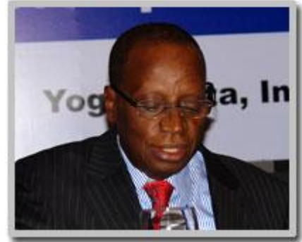
H.E. Dr. Shamsudeen Usman, Honorable Minister and Deputy Chairman of National Planning Commission (NPC), Government of the Federal Republic of Nigeria