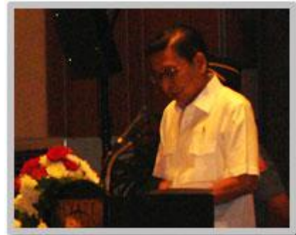
His Majesty Sri Sultan Hamengkubuwono X, King and Governor of Yogyakarta

His Majesty Sri Sultan Hamengkubuwono X, King and Governor of Yogyakarta was the first speaker of the international conference. He welcomed all the Ministers, PPD Board members and the participants in Yogyakarta. H.M thanked PPD for organizing the event in Indonesia and particularly for choosing Yogyakarta as a venue. He wished great success to all and invited all participants for dinner at Royal Palace.