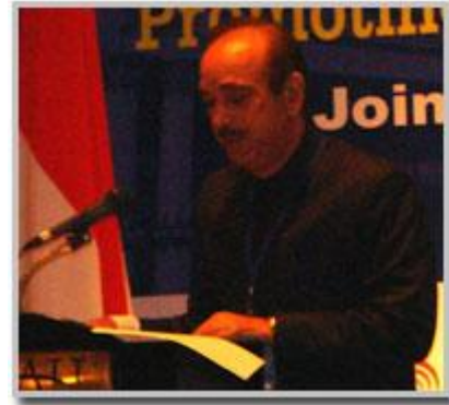
H.E Ghulam Nabi Azad, Minister of Health and Family Welfare, Government of India

He stated that the conference was more than opportune as the UN Secretary General has just launched the Global Strategy for Women's and Children's Health which aims to give a renewed thrust to scaling up efforts under maternal and child care in order to achieve the Millennium Development Goals 4 and 5 by 2015. Also, 15 years after ICPD, some impressive progress have been made, maternal mortality is estimated to have fallen by 34%, from an estimated 546 thousand in 1990 to 358 thousand in 2008. Still, the Chair said, it is worrisome that 99% of