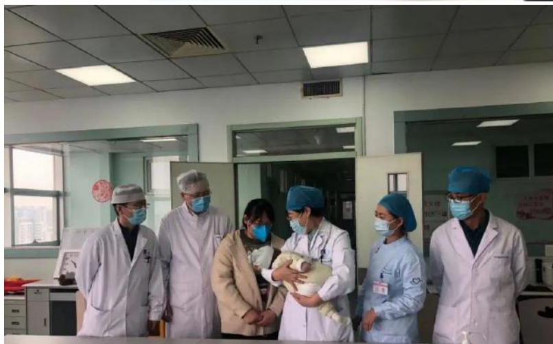
Ensuring the safety of mothers