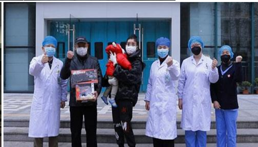
Giving priority to children